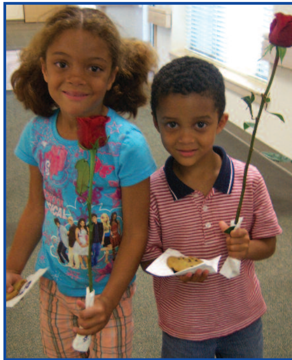
The great grandchildren of a patient attend a ceremony for a brick in memory of Great Grandmother on the HOET Walk of Friends.