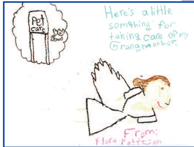
Flora's card for all the angels who work at HOET.