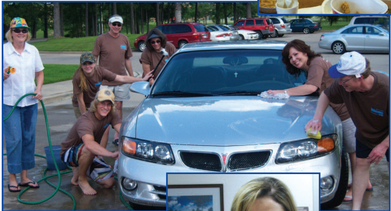
Employees of the U.S. District Court in Tyler volunteered their time for the United Way Day of Caring by washing visitor's cars at HomePlace.