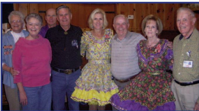
HOET Volunteers enjoyed a Square Dance Exhibition at the Volunteer Fall “Feast”ival.