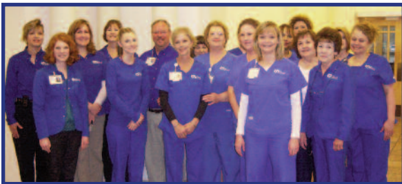
HOET employees dress in their new ‘True Blue’ attire.