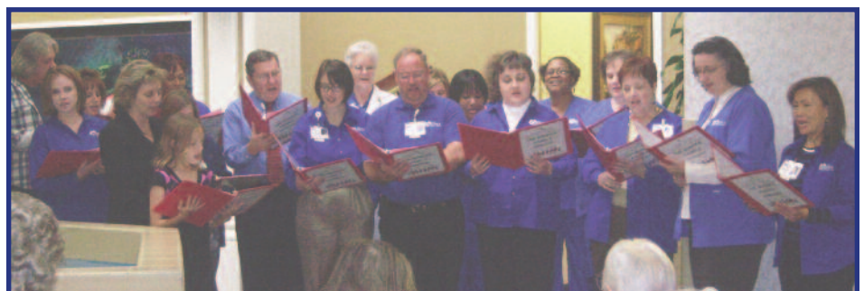
The “Hospice Family Singers” perform for residents of Park Place Nursing Home during the holiday season.