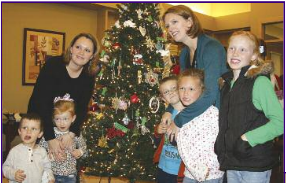
Families gather to place special ornaments on the Holiday Remembrance Tree in memory of their loved ones.