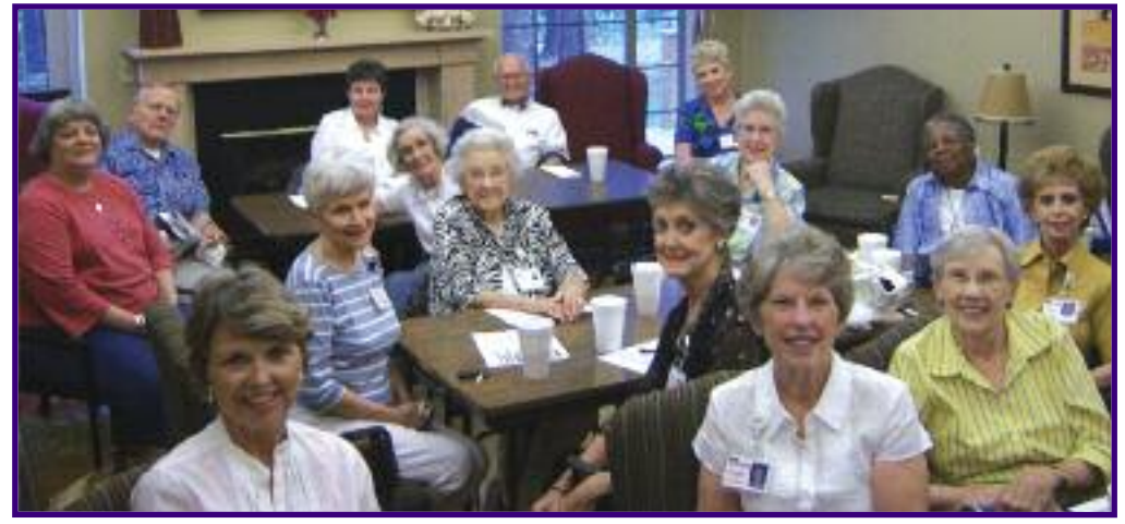
Volunteers who work the front desk at HomePlace attend a special training.