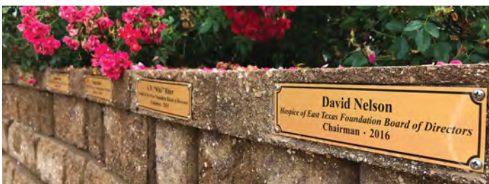
Each person serving as board chair of Hospice of East Texas and the Hospice of East Texas Foundation was honored with a brass plaque in the beautiful flag court on the Hospice campus in Tyler.

Hospice of East Texas celebrated its thirty-fifth birthday in 2017 by showcasing our extraordinary care, compassion and commitment and thanking the friends, donors and volunteers whose support makes our mission possible.