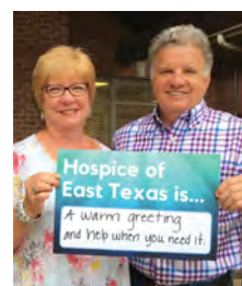
Staff and volunteers expressed what Hospice of East Texas meant to them in a social media campaign.