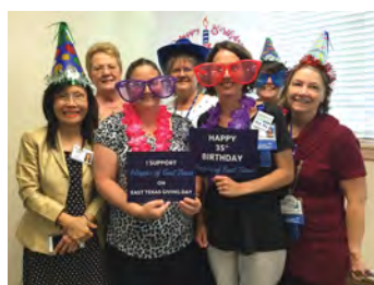
East Texas Giving Day and Volunteer Appreciation events followed the birthday theme in 2017.