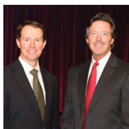
Almost 600 friends, donors and community leaders joined Hospice of East Texas at the Thirty-fifth birthday celebration on October 5, 2017.