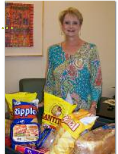
St. Mary Baptist Church